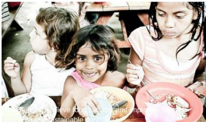
Goal 2 End hunger, achieve food security and improved nutrition and promote sustainable agriculture