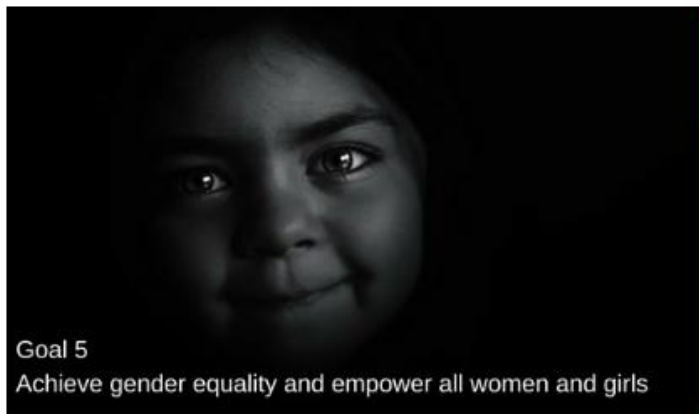
Goal 5 Achieve gender equality and empower all women and girls