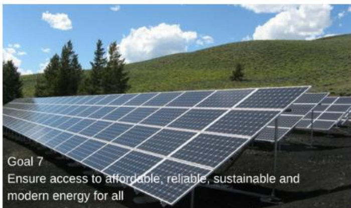
Goal 7 Ensure access to affordable, reliable, sustainable and modern energy for all