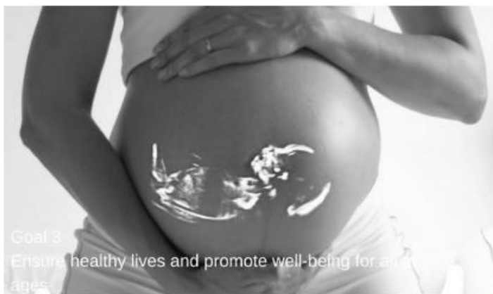
Goal 3 Ensure healthy lives and promote well-being for all at all ages