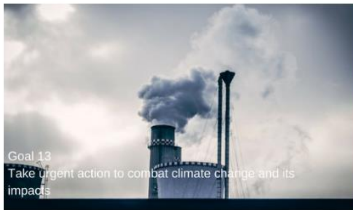
Goal 13 Take urgent action to combat climate change and its impacts