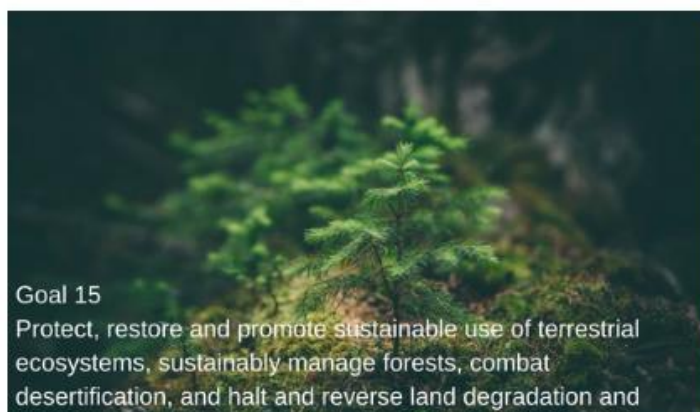
Goal 15 Protect, restore and promote sustainable use of terrestrial ecosystems, sustainably manage forests, combat desertification, and halt and reverse land degradation and