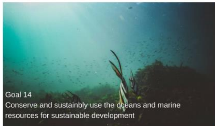
Goal 14 Conserve and sustainably use the oceans and marine resources for sustainable development