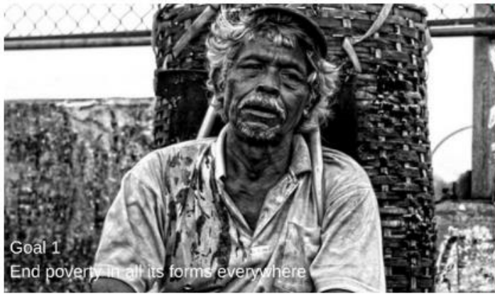
Goal 1 End poverty in all its forms everywhere