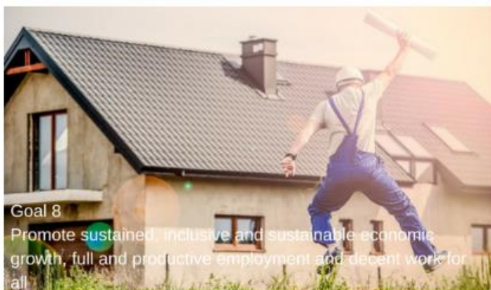
Goal 8 Promote sustained , inclusive and sustainable economic growth, full and productive employment and decent work for all