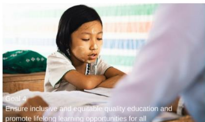
Goal 4 Ensure inclusive and equitable quality education and promote lifelong learning opportunities for all