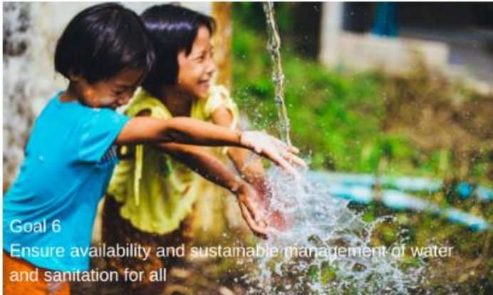
Goal 6 Ensure availability and sustainable management of water and sanitation for all