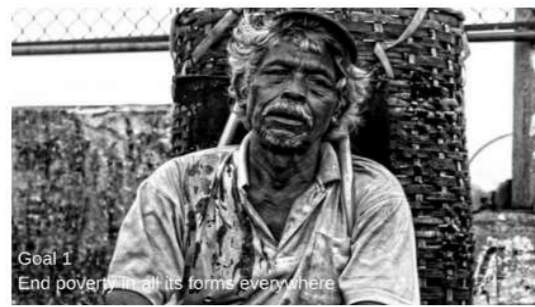
Goal 1 End poverty in all its forms everywhere