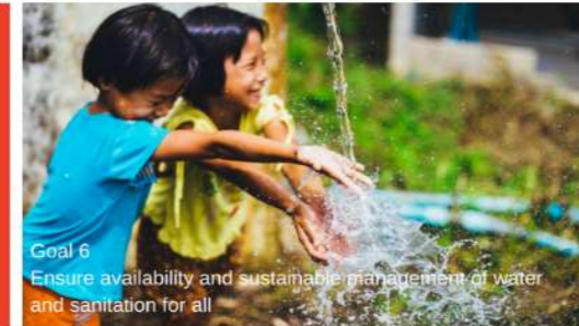
Goal 6 Ensure availability and sustainable management of water and sanitation for all