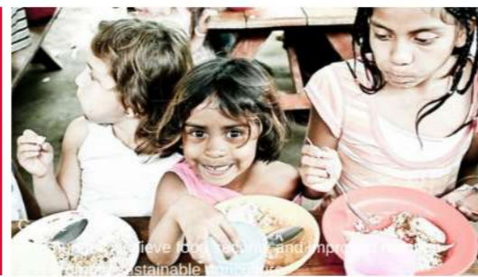
Goal 2 Achieve food security and improve nutrition and promote sustainable food systems