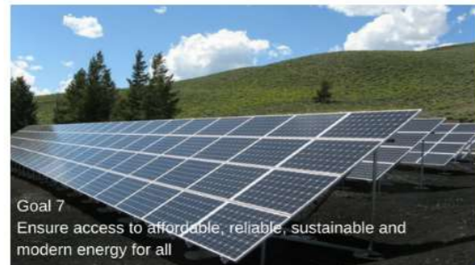
Goal 7 Ensure access to affordable, reliable, sustainable and modern energy for all