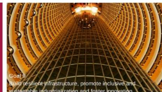
Goal 9 Build resilient infrastructure, promote inclusive and sustainable industrialization and foster innovation