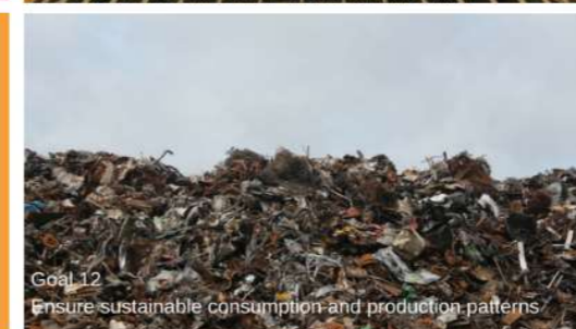
Goal 12 Ensure sustainable consumption and production patterns