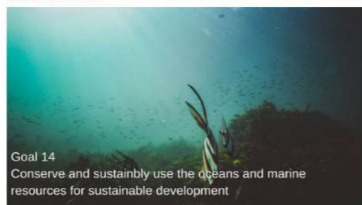
Goal 14 Conserve and sustainably use the oceans and marine resources for sustainable development