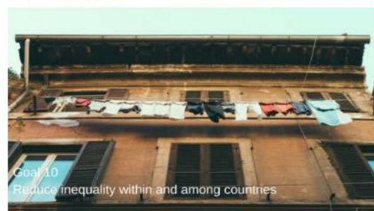
Goal 10 Reduce inequality within and among countries