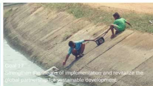
Goal 17 Strengthen the means of implementation and revitalize the global partnership for sustainable development