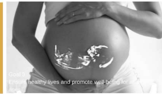
Goal 3 Ensure healthy lives and promote well-being for all at all ages