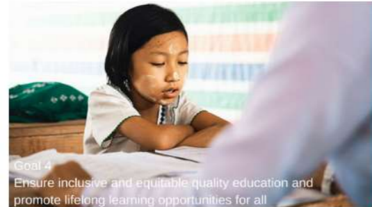
Goal 4 Ensure inclusive and equitable quality education and promote lifelong learning opportunities for all