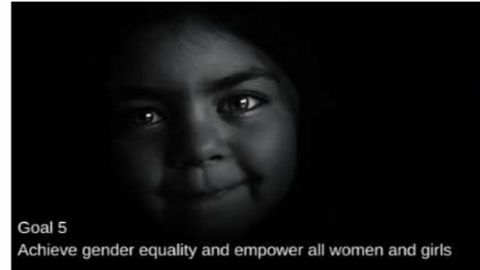
Goal 5 Achieve gender equality and empower all women and girls