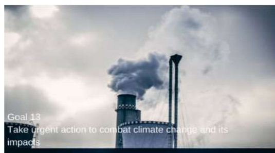
Goal 13 Take urgent action to combat climate change and its impacts