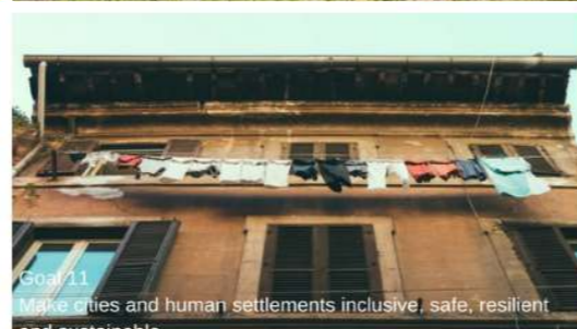
Goal 11 Make cities and human settlements inclusive, safe, resilient and sustainable